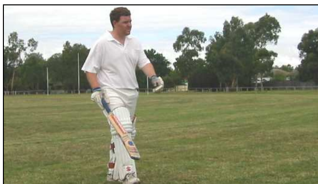
Red Bull (59) departs stage left.

All things considered it was a good win and makes it 2 out of 2 against Rosanna this season.