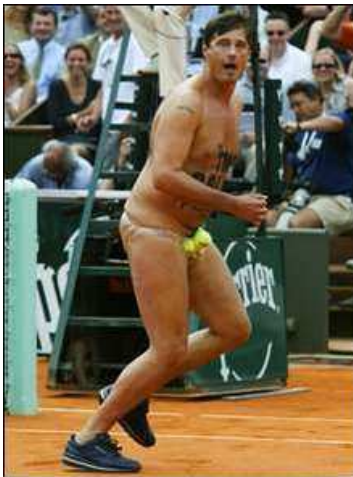
Banyule's "winning streak" as performed on a European claycourt

This week presents a new challenge with 4 tough games across the board. Despite recent wins, B Grade are still in 6 th position; only 4 points out of 2 nd position. Top spot is up for grabs if A Grade keep winning. C Grade are going nicely and D Grade need to keep winning to remain on top. Still 3 games left, 18 points up for grabs for each team. With nearly everyone available at the club there is no reason all 18 points cannot be gained by each team if they work hard and play well.