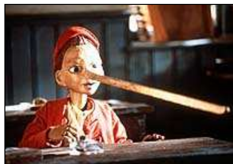
Occa tells the team that he "lost the toss"

Still going well in second spot on the ladder but looking for top. Go Bears.