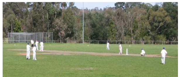
(Under 12s in the field Saturday 12 th October 2002)

Banyule Development 8/60 lost to Greensborough 3/72