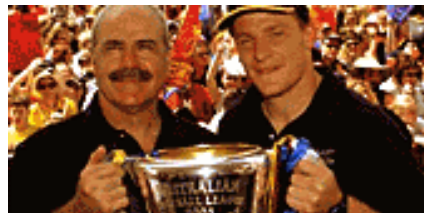
Leader & Moshpit collect the new Double Wicket trophy