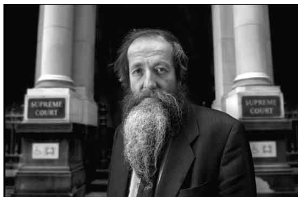
You Be The Judge: East Ivanhoe Saints insist that this child is Under 12.