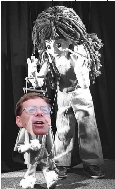
Top spot (9 & 1) Everything is under control in 4th grade.

Under 16s are in good shape, as are Under 14 Blue. Under 14 Maroon have had a great learning season. Under 12 Competition side are currently sitting in the Top 4.