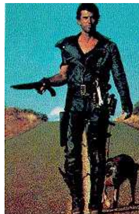
Brownie wanders the expanses of Chelsworth Park

Barnesy (3/79) & PD opened up the bowling and did well - taking an early one and causing a bit of trouble. Bowling to a thrashing machine is never easy, but when Willow brilliantly caught the East Ivanhoe shot-maker, things were looking up. Moshpit and TV (4/30) then bowled excellent spells - Moshy taking a wicket with his second ball of the day, following the 70 runs he'd made earlier. With five overs to go they needed ~45 to win. A potentially close finish was avoided when TV (again bowling in Bono-esque sunglasses) bowled a three-wicket maiden in about the 34th of the innings (X X • X • •) And that was that. Solid fielding and faultless catching a feature. Them All out: 173. Us: 4 wins-4 losses and Knocking On The Door.