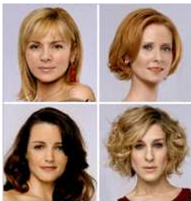
Positions in the Top 4 are wide open...

Amazing scenes! After the weekends games almost every grade is in a fierce battle to play in the finals. D Grade is almost certain of a spot, one more win should do it, which spot it is, is up to them though. A Grade missed a golden opportunity the last two games, two wins and they would be all but assured of finals action. 3 rd to 6 th are only separated by percentage. They are now in the position that they could win the last 3 games and still miss the finals - every game is now a must for the ones! B Grade defeated the top team on the weekend and are now only 1 game out of the four. Only 2 games separate top spot from 8 th spot. They are in a similar spot to A Grade in that they could win all three games and finish on top or 6 th . If you think A & B Grade are close, C Grade is as tight as the 5:08 train from Flinders street stopping all stations to Jolimont, running express from Jolimont to Clifton Hill, Clifton Hill to Ivanhoe, Ivanhoe to Heidelberg! Only 8 points separate 1 st from 8 th , 3 wins could secure a spot or miss out on one. The thirds need to win and win well to confirm their spot in the March action.