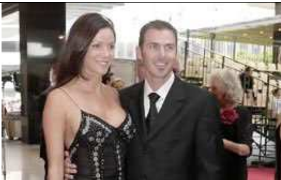
Damien Martyn enjoying some good recent form.