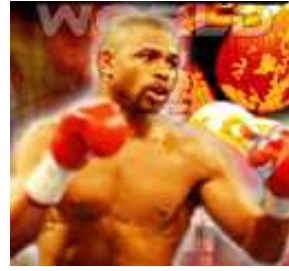
Feral (with groin intact).