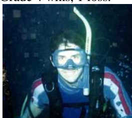
Philo diving for the catch in wet conditions at mid off

We bowled in the second session as the game fizzed out like a camp fire in the rain. Great to see a big Banyule crowd at the game towards the end. West finished 4/40-odd in their second innings. Solid win to the Good Guys, set up by the bowling on Day 1. Banyule A Grade 4 wins, 1 loss.