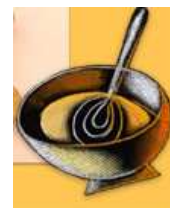
Is someone stirring the selection pot..?