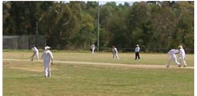
Marty rattles up 120*

Another warm one on Day 2 as the score grew - night-watchman Harpo Barnes, the silent? brother, played some nice lofted shots, which frustrated their very attacking field. Harpo went on to make a breezy 28 and things appeared to be cruising; but all the while we seemed to be losing wickets a bit too often. The middle order worryingly somehow came and went without too much addition to the score, though PD knocked a few around. All of a sudden we were in a fair bit of froth & bubble at 8/135-ish, still needing 20+ to win the match. Thankfully as Damo strolled out to the wicket at number 10, at the other end was Mr. Marty Phillips. Marty showed us all how to bat sensibly – consistently knocking balls into gaps for 2s. As Damo kept out the good ones, we went on to pass them 8 wickets down. Marty was on 68 at this time – when the captain asked if he'd like to keep batting on for a possible century, Marty hit 12 off the next over, had a think and decided he'd give it a crack. When the match was called off, he was 120 not out - his 10th A Grade century - and was in dire need of a drink, a cold shower and, as it turned out, a big red bucket of water. It was a great knock by Marty. Good to win while not playing especially well, though improvements are needed in catching and batting. A Grade 3-1.