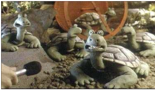
A tortoise explains the value of "patience" after defeating a hare in a foot race.

their wicket and we were subsequently bowled out for 230 odd in the last over of the match. Good batting from "The Colonel" with 60 odd and Ganno with 40 on one leg. B Grade 2-2.