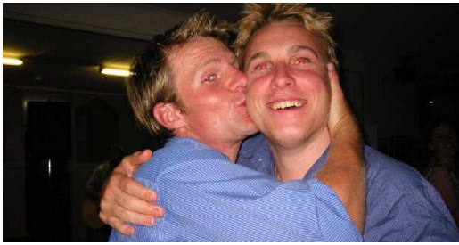
More evidence of Drought Fever at BCC.