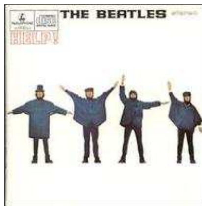
Signs made towards the carpark from A.J. Burkitt Oval as Beasty & Simmo rolled along.

Welcome back, Your dreams were your ticket out. Welcome back, To that same old place that you laughed about.