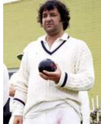
Another type of bowling