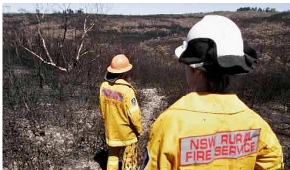
Volunteers on hand to extinguish Barnesy.